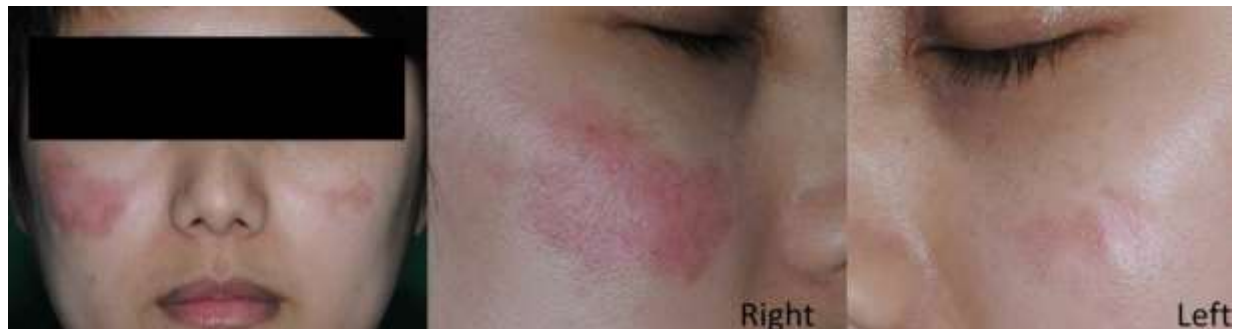
Figure 1: Tumid lupus erythematosus following hyaluronic acid filler injection. Bilateral erythematous, edematous non-scarring plaques with telangiectasias are located on both cheeks at exactly the previous injection points.

a 1:320 titer in a homogeneous pattern; however, anti-double stranded DNA was negative. Other blood tests were unremarkable. Based on the typical clinical manifestations and histopathology, the diagnosis of TLE was established.