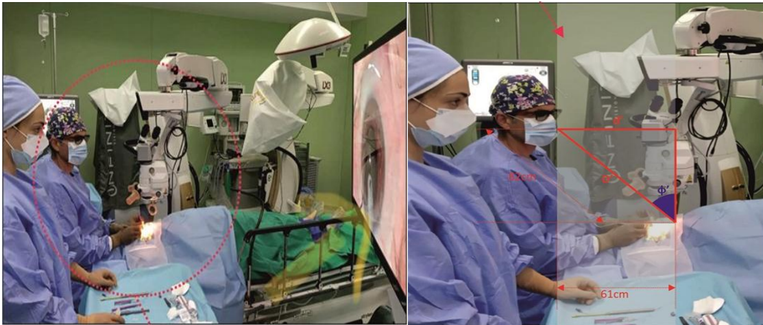
Figure 2: 3D Visualization Systems in Retinal Surgery. The critical distances and the floating droplets zone are marked in the picture.

When comparing the two methods, as it is shown in the figures 1 and 2, the 3D visualization system offers a better sitting position over the patient, which lowers the risk of infection. Operating with the NGENUITY 3D system is increasing the distance between surgeons and patient's mouth by about 70% (48cm to 82cm). According to risk graphs from literature (figure 3) [3], this increase in the distance is reducing the absolute infection risk from approximately 5% to 4%, which is a 20% reduction, while the risk ratio [RR] is increased from 3% to 4.5%, a 50% increase. Also, the angle from the patient's vertical axis starting from his mouth is increased from approximately 31.33 degrees to 48.07 degrees, which is a 65% increase.