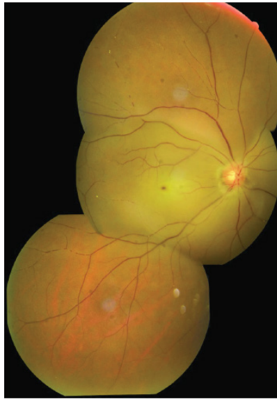
Figure 1: Montage fundus photograph of right RAO with dense retinal whitening and a small cherry red spot. There are emboli on the disc, at the bifurcations and terminals; with presence of boxcarring of blood column in the retinal vessels.

detachment. There were migration of emboli at the posterior pole by infrared photograph. Carotid color Doppler images (CDI) showed atherosclerosis with severe stenosis to nearly total occlusion of right internal carotid artery (ICA). Arterial flow decreased to 76.5 (cc/min) at proximal ICA and were vanished at the occlusion site. There were relatively increased flows of left proximal ICA (301.3 cc/min) and left vertebral artery (221.3 cc/min) as responsive compensatory flow to maintain the intracranial circulation. Orbital CDI revealed reversed right ophthalmic flow. This patient was referred to neurology department for further evaluation and treatment. Vascular surgery such as carotid stenting was suggested but refused by patient after explanation due to stable condition and no neurologic deficit developed during follow up. His visual acuity maintained light perception in the right eye. At five week follow up, OCT demonstrated subsided macular edema. More emboli can be identified at central macula. At three year follow up, OCT demonstrated macula thinning with flat fovea. No rubeosis iridis was found.