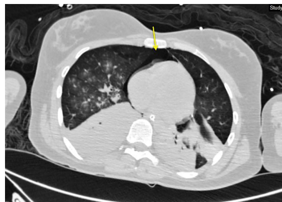
Figure 3: Chest CT scan. Arrow shows air in the mediastinum.

An intercostal drain was positioned (Pleurevac) on the right 5 th intercostal space. The patient was mechanically ventilated during the following day, with progressive improvement in her vital signs, blood gas exams and follow-up