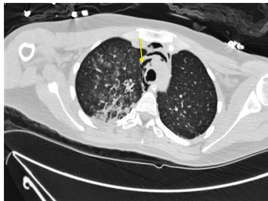
Figure 2: Chest CT scan. Arrow shows air in the mediastinum.