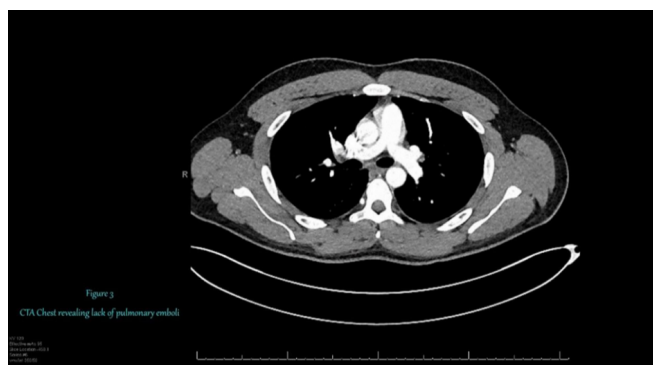
Figure 2: CTA negative for PE.