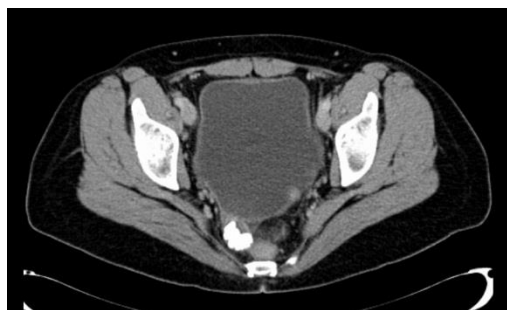
Figure 1: Pelvic CT-scan with a tumor at the right pelvic wall, suspicious for a teratoma.